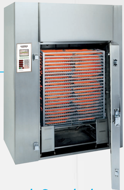
single-truck smokehouse Fishmoker JS H-2250/1