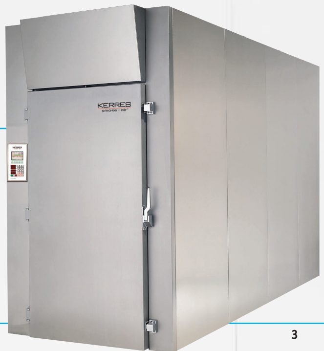
multi-truck universal smokehouse Fishmoker JS H-2850/4