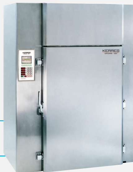
single-truck-unit Fishsmoker JS H-1950/1